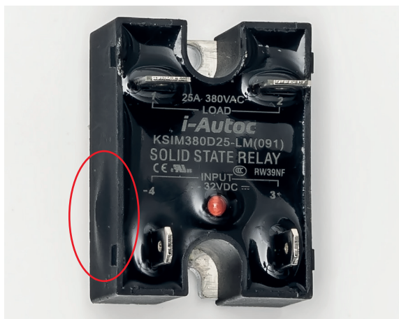
Figure 1: Solid-state relay, article no. 072044

A failed relay can look intact from the outside or burnt to varying degrees (see example picture). In many cases, one of the safety thermostats (Klixons) tripped. In isolated cases, the power board had to be replaced.