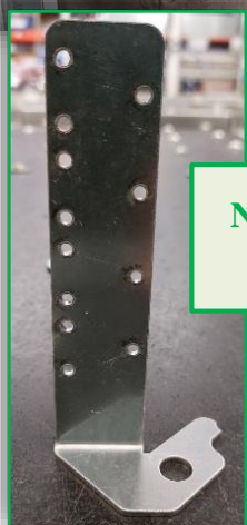
New EV support bracket Spare code: 264694