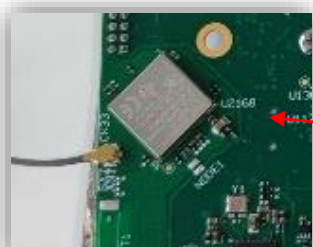
Wi-Fi and Bluetooth chip

Back of the current CPU board with Wi-Fi e Bluetooth chip no more available