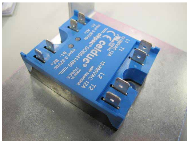
SSR SOLID STATE RELAY 072 615 OLD