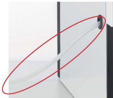
Old: "Transparent" milk hose