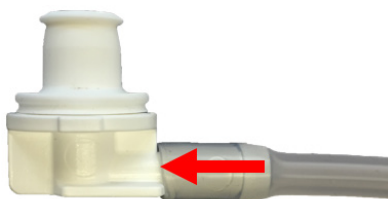
Plug & Clean adapter

The new hose is black-transparent rather than just transparent in order to prevent mix-ups. Old "transparent" hoses (art. no. 00.0048.4948) in the field should be replaced with the new "black-transparent" hose (art. no. 00.0048.4939) as soon as possible, at the latest by the next due date. The recommended interval for replacing the milk hose is 6 months; see operating instructions. The old "transparent" hoses must no longer be used on the SC Club after this point!