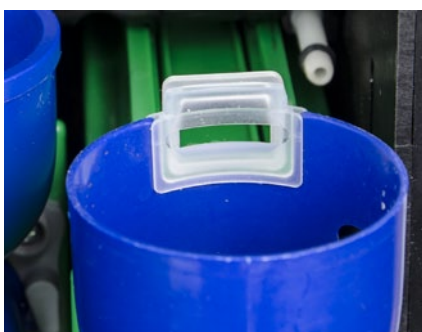
Pull out the mixing cup insert as far as it will go. Insert the mixer adapter into the cutout in the mixing cup.