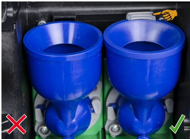
Mixing cup without (left) and with (right) the new extraction device.

From serial number 1614... / week 14, the "retrofit kit for mixer extraction device" will be installed at the factory.