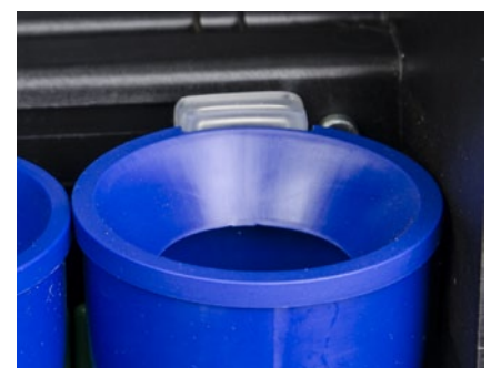
Push in the mixer insert. Make sure that the "mixer adapter" completely encloses the intake nipple of the mixer channel.