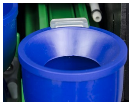
Attach the mixer lid to the mixing cup.