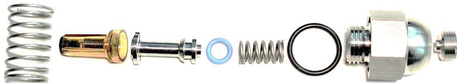
Figure 1: Contents of repair set

The repair set can be used to avoid replacing a complete pump or pump head if the following fault patterns occur: