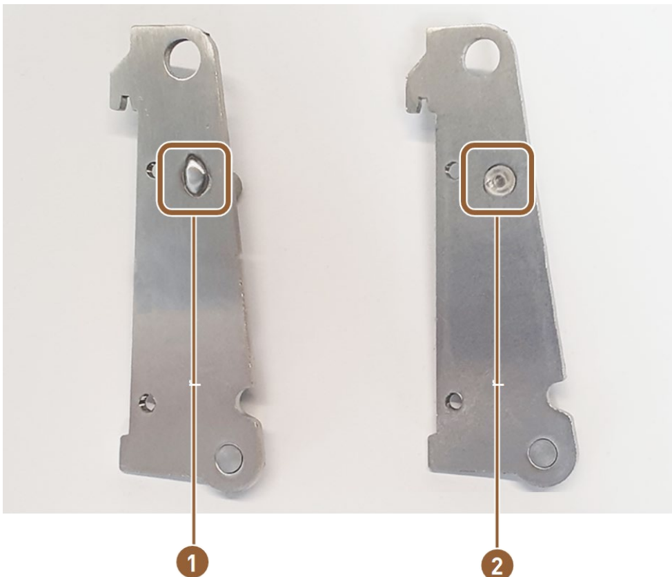
Figure 1: NEW: Retaining plate with reinforced weld seam. The welded bolt remains stable.