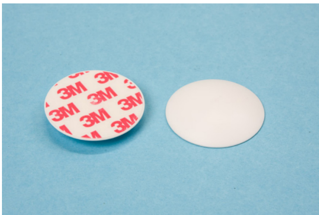
Figure 1: ABS buffer 3370074789

In this case, an ABS buffer (3370074789) must be attached to the rear right-hand side of the grounds container shaft. This pushes the grounds container slightly to the left so that it is correctly detected by the sensor.