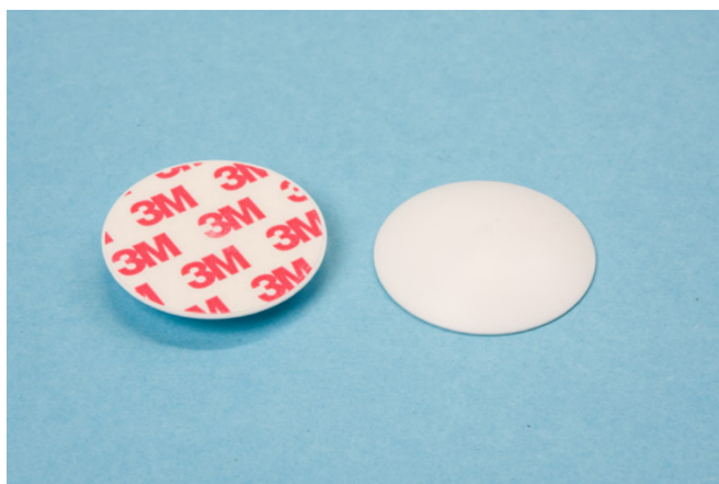
Figure 1: ABS buffer 3370074789

In this case, an ABS buffer (3370074789) must be attached to the rear right-hand side of the grounds container shaft. This pushes the grounds container slightly to the left so that it is correctly detected by the sensor.